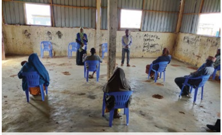
COVID-19 information sharing campaigns in Baidoa, Bay Region.

The CCCM partner trained 45 Camp Management Committee members on the HLP in Luug. The purpose of the training was to ensure the CMCs are aware of the land tenure issues, properly map and refer sites at risk of eviction to the HLP actors.