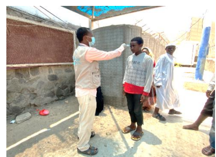
A medical assistant screens refugees and asylum-seekers entering the UNHCR reception centre in Aden. Those with a high temperature are referred to the Basateen clinic, supported by UNHCR. March 2020.