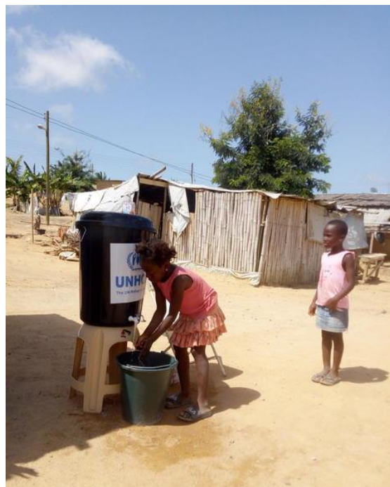
Extra handwashing facilities to fight the spread of COVID-19 at Egyeikrom camp in Ghana.