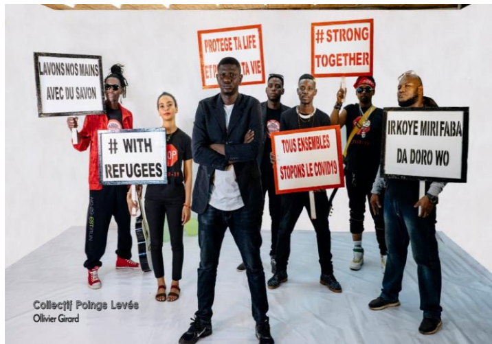
The seven members of the Nigerien hip-hop collective "Poings Levés" raising awareness on COVID-19 as part of the UNESCO's #DontGoViral campaign.