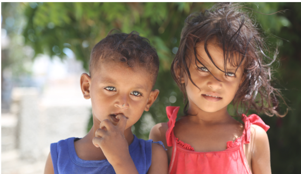
Internally displaced children, who with their families, have had to resort to living on an IDP hosting site (Al Rabat) in Lahj governorate, southern Yemen. IDPs living on hosting sites are at greater risk of contracting communicable diseases, including COVID-19.

UNHCR together with the municipality of Rehovot in Israel , organized an online parental guidance meeting for asylum-seekers of specific targeted group of origin. The meeting was led by an educational psychologist from the municipality aimed at offering information and tools for parents to deal with children's psychological needs, and to share challenges and coping strategies between families during the COVID-19 crisis.