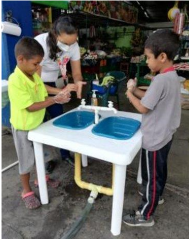
Improvement of sinks with hygiene items such as antibacterial soap.