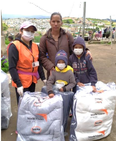
Delivery of blankets and mattresses in settlements in Ipiales, Nariño.

In April, over 60,100 beneficiaries received one or more type of assistance from 15 RMRP direct and implementing partners, in 31 municipalities of 15 departments, in border and transit areas, as well as areas where refugees and migrants have an intention to stay. The Multisector subgroup has focused its response to adapt and expand the operation of temporary shelters, given that preventive isolation measures have limited their reception capacity, as well as the rotation of people within them.