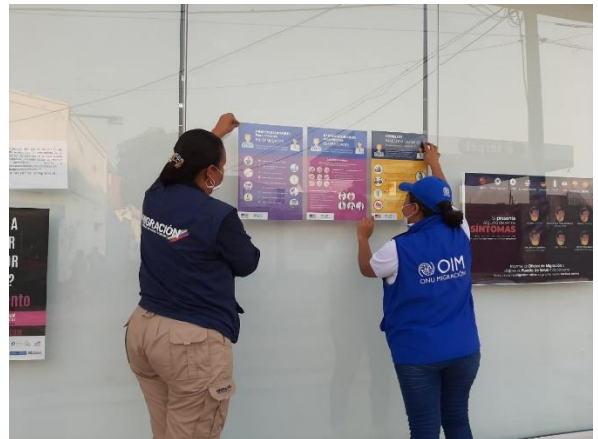
Information and orientation posters for the refugee and migrant population, with advice on health care and water and sanitation.

Over 5,500 girls and boys received specialized child protection services, to prevent and respond to violations of rights during their migration process, including access to care and shelter spaces for unaccompanied children and/or adolescents often living on the street, in close coordination with the Colombian Institute of Family Welfare. More than 2,700 persons at risk of trafficking participated in prevention activities related to the creation and dissemination of risk indicators, identification of warning signs, as well as assistance and reporting routes. Over 300 refugees and migrants received information services related to the prevention of and response to GBV, through community strengthening initiatives and guidance on protection routes. In addition, more than 78 people were trained in the prevention of and response to GBV in the context of mixed migratory flows.