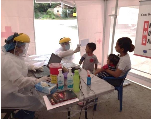
Health care for refugees and migrants from Venezuela in the Pescadero sector, in Santander.

During the month of April, more than 54,300 beneficiaries received one or more services from 43 RMRP direct and implementing partners, in 45 municipalities of 24 departments, in border and transit areas, as well as areas where refugees and migrants have an intention to stay. The sector prioritized the support to health care delivery and the adaptation of the response to refugees and migrants, to ensure the availability of health services through case follow-up, epidemiological surveillance, recruitment of personnel, and procurement of medical equipment and personal protective equipment for health workers, in coordination with the Ministry of Health and the National Institute of Health.