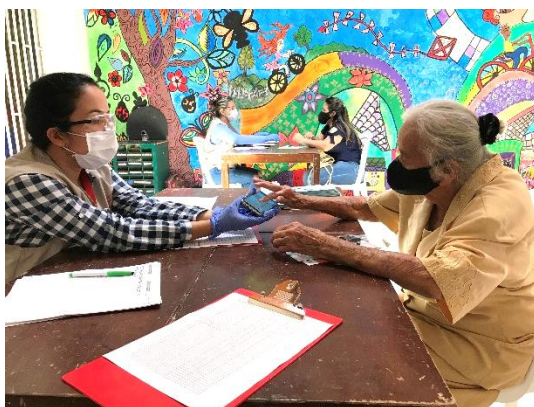
Delivery and orientation on multipurpose transfers to the refugee and migrant population in Medellín, Antioquia.

During the month of April, more than 64,800 beneficiaries received one or more types of assistance from 15 RMRP direct and implementing partners, in 42 municipalities of 14 departments. The beneficiaries were supported through various multipurpose transfer modalities. Most of these distributions are accompanied by awareness raising sessions on the use of cards or other distribution mechanisms, and in addition, guidance on COVID-19 prevention was provided, by telephone and in person, while taking into account biosecurity measures.