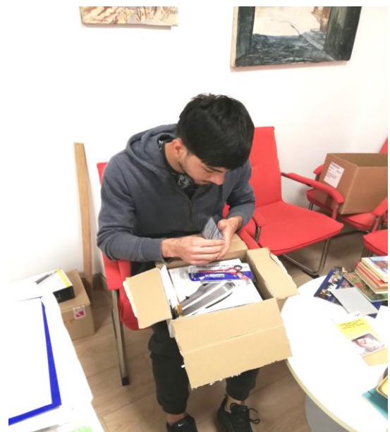
Young asylum-seeker, studying to become a barber in Serbia, ©UNHCR, May 2020

Country Office in Belgrade and Field Unit in South Serbia for regular protection monitoring in five Asylum Centres and 25 other sites across the country