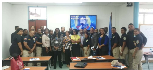
Figure 1: Facilitators and participants from the National Police at a workshop on International Protection of Victims of Trafficking in Persons (Santo Domingo, DR; 10 March 2020)