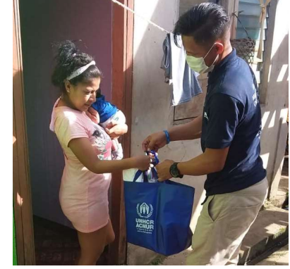
Figure 1: Hygiene and baby kits were distributed to single mothers in Port Kaituma, Region 1

A partner supported Ministry the Public Health (MOPH) in Guyana to translate lifesaving information COVID-19 into Spanish, to reach out Venezuelan refugees and while migrants, another R4V partner administered vaccinations to 138 persons.