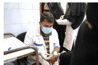
A medical staff partner carries out testing in a UNHCR supported clinic in Aden.

Close to 1,000 refugees, asylum seekers, and Yemeni nationals accessed urgent health services at the five UNHCR-supported clinics across the country during the reporting period. UNHCR educational activities reached close to 3,300 refugees and host community members. About 200 refugees received mosquito nets and awareness-raising material on diseases transmitted by mosquitoes, including malaria, dengue and chikungunya. In Aden and Sana'a, clinics reported an increased number of patients suffering from a fever-like illness. The operation is closely monitoring this trend.