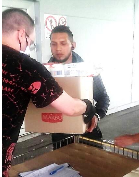
Distribution of food and hygiene parcels in Kraljevo, May 2020