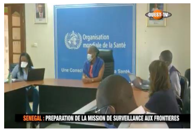
Meeting between WHO, IOM and UNHCR in Dakar, Senegal, in the context of a joint initiative to provide support to the authorities with controls and epidemiological surveillance in border areas, in Senegal. The news story by Ouest-TV is available online.

- In Burkina Faso, 326 people on the move in mixed flows, including 69 women and 74 children, were screened by UNHCR and partner, the Danish Refugee Council (DRC), from January to February 2020, in the nine counselling centres set up in the Sahel, Hauts Bassins and Cascades regions. Most common countries of nationality included Mali and Côte d'Ivoire. 52 of these people were referred to one of the three regional transit centres.