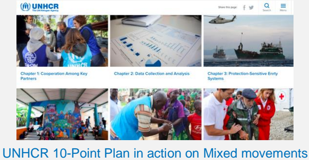
and Refugee Protection