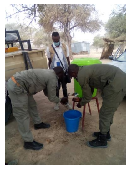
Preventive actions against COVID-19 captured in Niger by CIAUD-Canada, UNHCR's protection monitoring partner, at the police checkpoint in Maine Soroa, on the border with Nigeria.