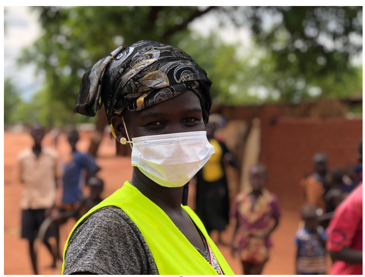
Pamir, Jamjang county