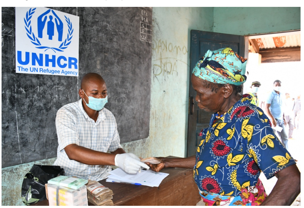
A refugee from the Central African Republic receiving her cash for food assistance for the coming two months in Inke camp, Nord Ubangi province.

In the region, UNHCR and partners are actively supporting remote learning structures to facilitate continuity for students. Refugee teachers and teachers working for UNHCR's education partner in Angola have been preparing weekly assignments and distributing them to the 643 children enrolled in third to seventh grades in the Lóvua settlement schools. In collaboration with Yetu Community Radio, UNHCR and partners in Malawi are broadcasting a radio lesson programme for 234 students around 14 years-old in eighth grade as a pilot, and offering revision lessons for postponed exams.