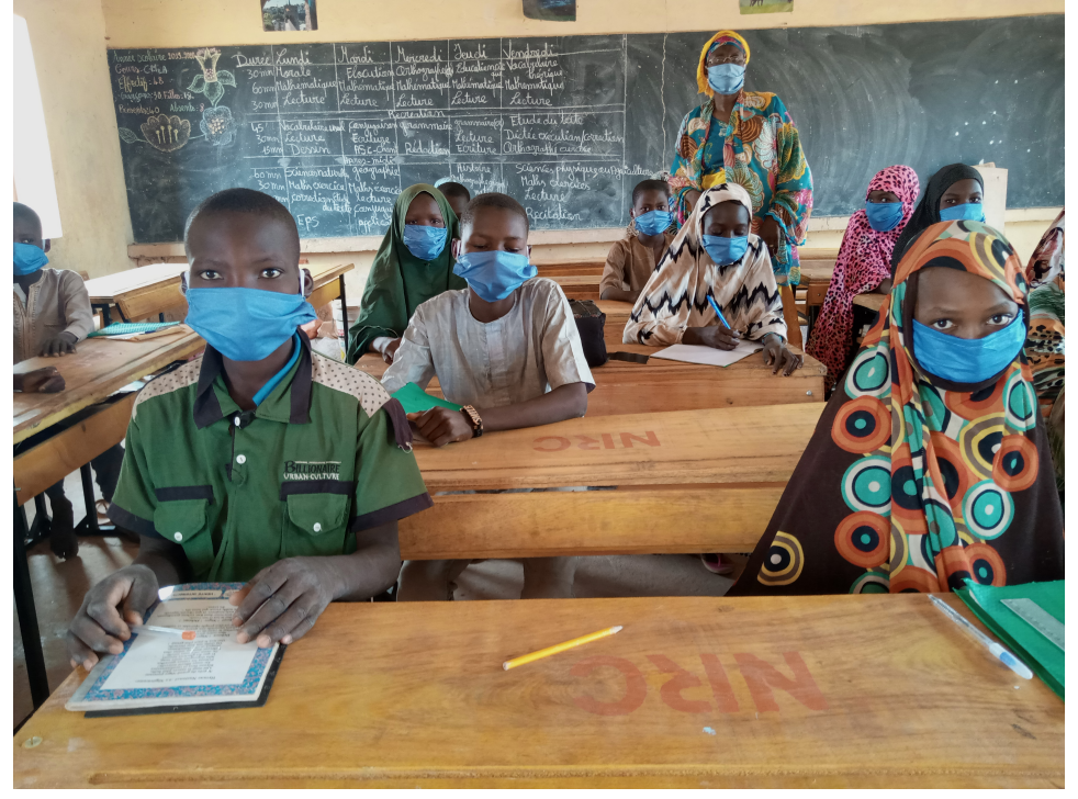
Remedial courses in the school of Sakaraoua village