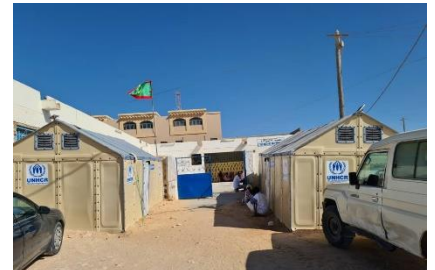
RHUs donated by UNHCR in Nouadhibou

As part of its activities in support of the Government's response for COVID-19, and at the request of the Chief Medical Officer of the Nouadhibou department, UNHCR donated two prefabricated buildings (Refugee Housing Units - RHU) which will be used to carry out the triage of patients before they access the department dispensary compound.