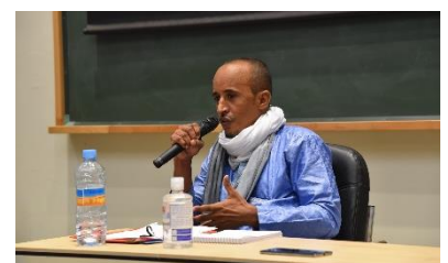
The Mauritania DAFI Club President during the UN75 dialogue

In collaboration with WHO, UNHCR organized the UN75 dialogue "Study the present to build the future" where DAFI refugee students discussed with the Nouakchott medical school students the importance of solidarity during the pandemic times. Together with UNDP, UNHCR took part in a radio show on peaceful coexistence broadcasted by the Bassikounou local radio. In addition to this, UNHCR also hosted in its facilities the UN75 live talk-show "The Mauritania we want" featuring young Mauritanian influencers.