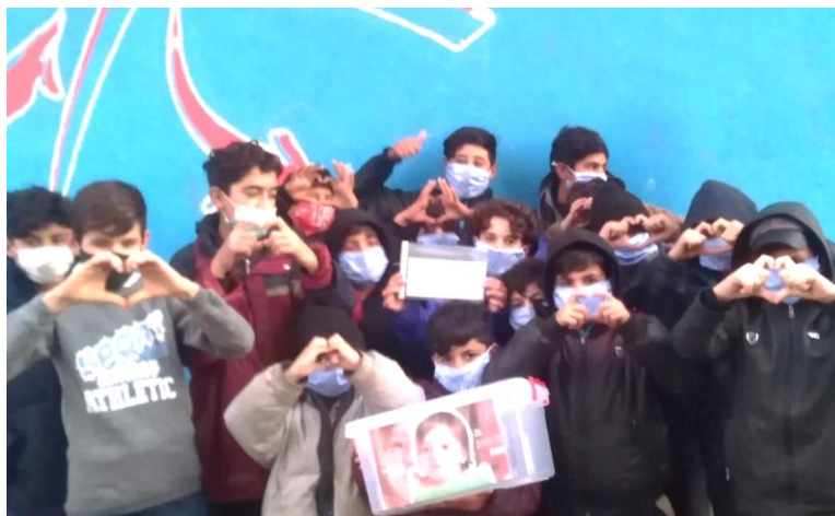
Children in Sombor RTC sending their love to ill children in Serbia

Serbian public was touched by the story of K.M. - Syrian man accommodated in Sombor Reception/Transit Centre (RTC), who initiated a money collection amongst Arabic-speaking residents of this RTC for Serbian children who suffer from rare illnesses which require expensive treatments abroad. Like a domino effect, this initiative spread amongst all residents of Sombor, Kikinda and Obrenovac RTCs and Krnjača and Tutin Asylum Centres (AC), with the positive media carrying the story under the title „ Migrants collecting money for treatment of children from Serbia “.