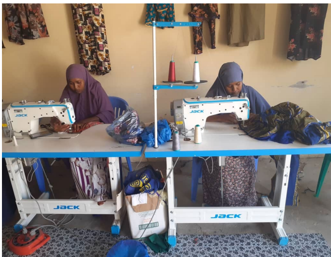
Internally displaced women enrolled in the cloth face mask production in Hargeisa. This activity provides a much-needed income for the women, while responding to the need of PPEs.