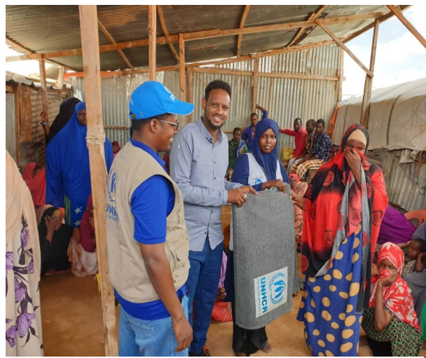
IDP families receive NFI kits in Galkayo.