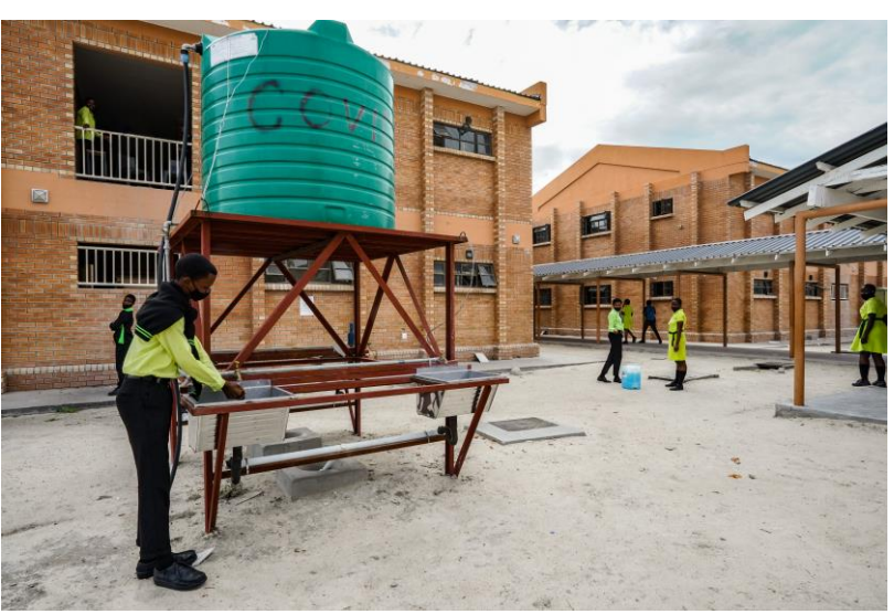
Additional handwashing stations in Nata Senior Secondary School, Botswana, help students and staff maintain COVID-19 hygiene levels. In Botswana, refugees attend the national schools alongside Batswana right up until matriculation.

■ Since 1 September... 5,282 people in refugee-hosting communities in South Africa were reached with important COVID-19 information about mitigation prevention and measures through digital pathways and community networks; 1,850 refugees and asylum-seekers in Botswana and South Africa received masks and other equipment to protect them from the spread of COVID-19; a refugee status determination exercise began for the approximately 1,000 refugees and asylum-seekers in Dukwi