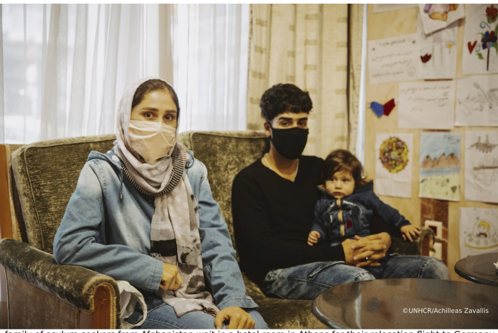
A family of asylum-seekers from Afghanistan wait in a hotel room in Athens for their relocation flight to Germany.