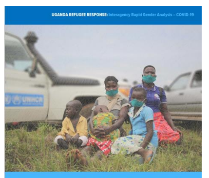
Interagency Rapid Gender Analysis – COVID-19

complete their education journey puts them on a pathway to a sustainable future.