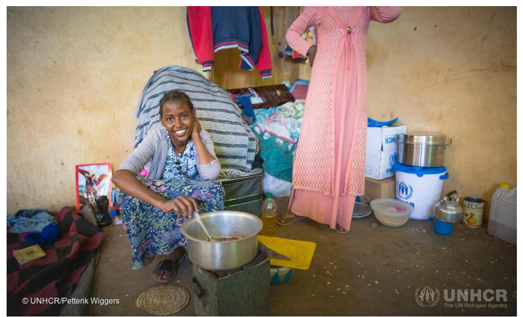
An Eritrean refugee cooks for her family at Mai Aini refugee camps in northern Ethiopia.