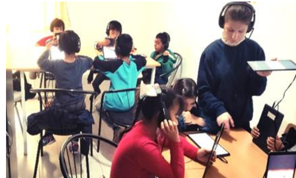
Supporting children in online schooling in Krnjača Asylum Centre

In Jan-Feb 2021, 53 refugee families received keys to apartments in Zrenjanin and Sombor within the Regional Housing Programme (RHP). OSCE and UNHCR supported the local authorities in Bujanovac in preparing a project proposal for EU-funded UNOPS CfP, which would aim at sustainable closure of the last remaining collective centre in Bujanovac ("Salvatore") and solutions for its residents (mainly Roma IDPs). The decision on approval of funding is pending.