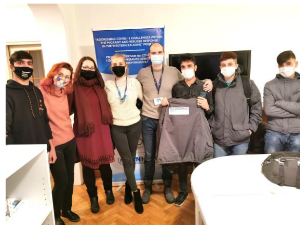
Right: Unaccompanied refugee boys who have become peer educators mark the completion of second year of the project with the staff of CRPC, DRC and UNHCR, @DRC, Jan 2021

The number of residents in Asylum (AC) or Reception/Transit Centres (RTC), decreased by 28% compared to end-Dec 2020 to 4,655 at the end of Feb 2021. They comprised 2,069 citizens of Afghanistan, 879 of Syria, 294 of Pakistan, 208 of Somalia, 176 of Iraq and 1,029 from 47 other countries. 3,978 are adult men, 263 adult women and 414 children, including 76 UASC. A total of 5,675 new refugees and migrants were counted to be present in the country at end-February , including those staying outside of governmental centres. The authorities continued systematically gathering refugees and migrants staying outside the centres, in downtown Belgrade and in border areas, and transferring them to official centres with vacant places.