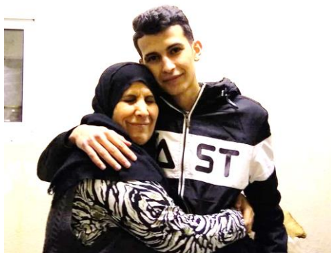
Left: Syrian refugee boy reunites with mother in Austria following 11-month long procedure, @UNHCR, Jan 2021

One new case of Covid-19 amongst the refugees/migrants was reported in the first two months of 2021 – bringing the total number of cases recorded since March 2020 to 31, and the number of casualties to one.