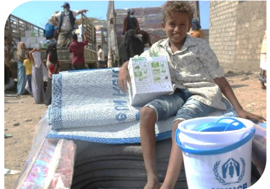
An IDP boy receives emergency supplies at a distribution site, where NFI and shelter kits were distributed to displaced Yemeni families in Taizz and Lahj governorates.

UNHCR has dispatched 200 Enhanced Emergency Shelter Kits (EESKS) and 500 Non-Food Item (NFI) kits to Taizz governorate, with an additional 200 EESKs and 700 NFIs on the way . Since early March 2021, the western borders of Taizz governorate have witnessed increased hostilities. Civilian infrastructure, including schools, markets and houses have been significantly damaged by recent clashes, resulting in at least 120 civilian casualties and a wave of new displacement, with over 1,000 families (7,000 individuals) newly displaced in Taizz since the beginning of the year. A Rapid Protection Assessment conducted by UNHCR partner INTERSOS revealed that those newly displaced are in urgent need of shelter, food, water, and protection assistance. Many displaced families are forced to share shelters — with an average of three to five families under one roof — limiting privacy and increasing exposure to communicable diseases and protection risks, particularly for women and girls. For further information, see UNHCR's Update on the humanitarian situation in Taizz.