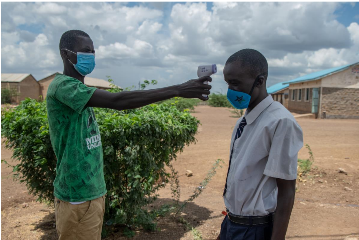
A learner at Arid Zone Primary school in Kakuma Refugee Camp in Kenya has his temperature taken at the school's main entrance. Temperature checks are part of COVID-19 containment measures implemented in schools.

In Sudan, the increase in COVID-19 cases in North Darfur in the past month, a “third wave” was declared by the Governor and schools were closed except for the students sitting for exams.