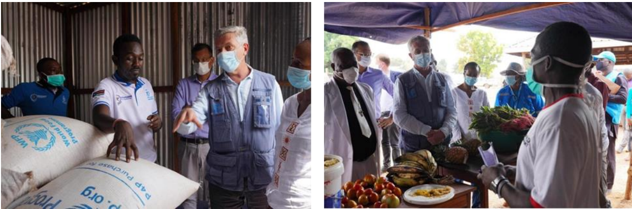
UNHCR High Commissioner Filippo Grandi visiting the market in Makpandu refugee camp in January 2021.

The project in Yambio has increased agricultural harvests resulting in improved food security and has allowed households to diversify their diets and boost their nutrition levels. Furthermore, the agricultural output of the self-reliance project was so high, that WFP was able to source some of its food staples from the refugee run project. Refugees are currently selling their produce to complement the WFP general food distribution, providing a best practice in sourcing locally, sustainable, seasonal produce, while supporting livelihoods.