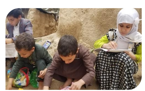
Displaced Yemeni children take part in recreational activities after receiving toys and educational materials from UNHCR partner YDF in As Safra district, Sa'ada governorate.

Continued fighting at the border between Marib and Al-Jawf governorates is aggravating the humanitarian needs of displaced populations in the area. Escalation in hostilities since the beginning of 2018 in Al-Jawf have left at least 189,340 displaced Yemenis and members of hosting communities in acute need of humanitarian assistance. During the first quarter of 2021, UNHCR and partners conducted needs assessments for more than 4,600 displaced families, the majority of whom arrived from Marib governorate and settled in Al-Jawf