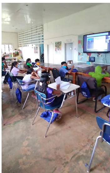
School in Mabaruma, Guyana

Rent subsidies were given to vulnerable Venezuelan refugees and migrants to secure medium- and long-term accommodation .