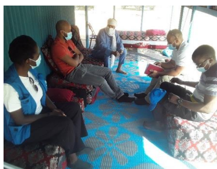
Field visits and consultations with beneficiaries and partners in Hodh Chargui region during the second scoping mission in February 2021.