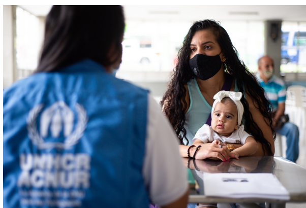
UNHCR staff member delivers cash assistance to Venezuelan refugee families in Medellín.