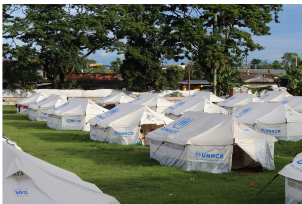
UNHCR's temporary reception point Alcide Ceballos in Arauquita set up as a response to the shelter needs of Venezuelan refugees and Colombian returnees forced to flee Venezuela