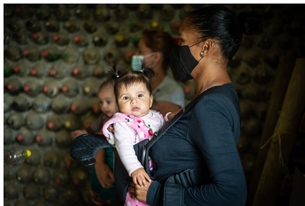
UNHCR meeting with a group of Venezuelan refugee women in Bello Oriente on tackling the prevention and mitigation of gender-based violence through theater.