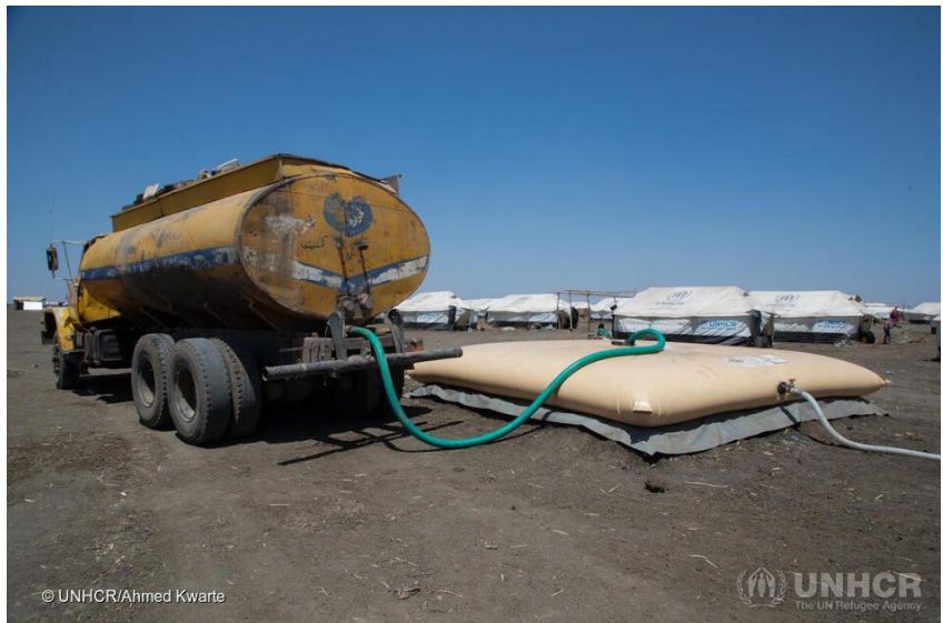
Ethiopian refugees collect water provided by tankers to the water points at Tunaydbah settlement.

In Um Rakuba, the water production is 19.2l/p/d provided through water trucking by UNHCR, CARE, and IOM. MSF provided a generator to support IOM in providing water to the hospital. Bacteriological analysis of water samples in May shows some contamination, which may be due to groundwater contamination. The results are being rechecked.