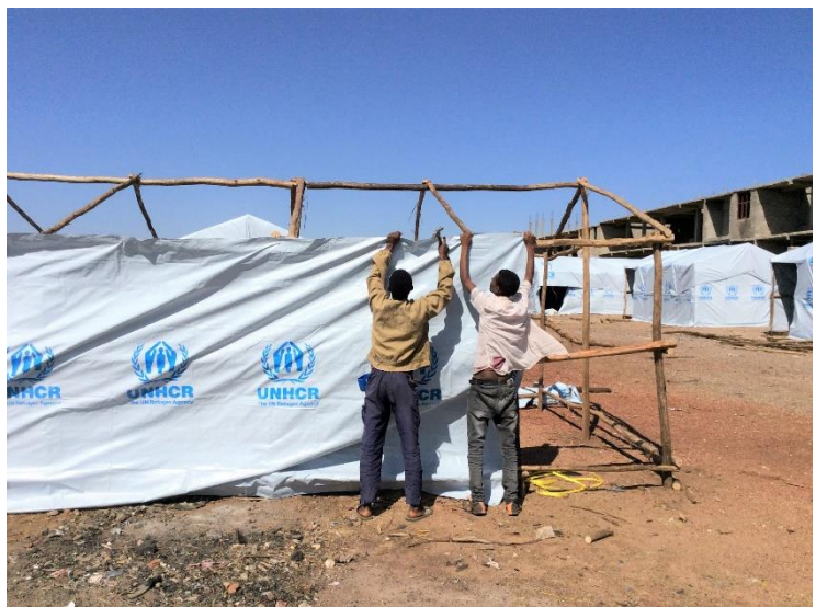
In Shire, UNHCR and NRC construct emergency shelters for newly identified IDP sites to benefit the internally displaced families who fled conflict in western Tigray.

In Shire, UNHCR has completed the construction of 250 emergency shelters in sites including Five Angels location in Shire, where additional 250 emergency shelters are being constructed by Samaritan's Purse. This will contribute toward the relocation of some 25,000 individuals (5,000 families) in need of relocation from overcrowded schools.