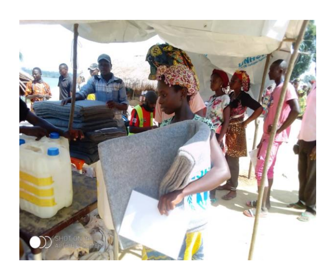
A newly registered CAR refugee woman receives core relief items during distributions organized by UNHCR and ADSSE in South Ubangi