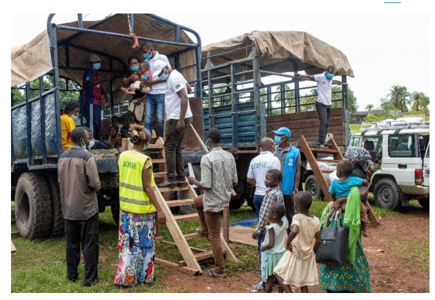
A CAR refugee family is being relocated to Modale site.