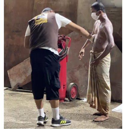
Partner IRC providing urgent medical assistance at a disembarkation point.

As of 23 June, a total of 12,681 refugees and migrants have been reported as rescued/intercepted by the Libyan Coast Guard (LCG) and disembarked in Libya in 2021. So far in June alone, a total of 2,503 individuals have been disembarked, with 41 per cent at the Tripoli commercial port, 39 per cent at the Tripoli Naval Base and 20 per cent at Al-Zawiya (45 km west of Tripoli). UNHCR and its medical partner, the International Rescue Committee (IRC), continue to be present at the disembarkation points to provide urgent medical assistance and core relief items (CRIs) before individuals are transferred to detention centres by the Libyan authorities.