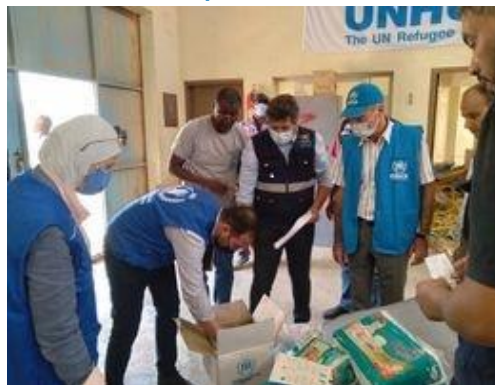
Joint distributions with LibAid, WFP and UNHCR in Eastern Libya.

UNHCR's Chief of Mission completed a one-week mission in Benghazi, made jointly with the WFP Country Director. During the week, the mission was able to visit Al Haleis Tawerghan internally displaced persons' (IDP) settlement, the biggest in east, where they met with IDPs and the camp's management. There was also an opportunity to attend LibAid's distribution of CRIs and hygiene kits to 20 families (137 individuals) of Murzuq IDPs hosted in Benghazi (with 486 families/2,785 individuals reached in this distribution campaign). On the same day, WFP distributed food baskets. At the IDP settlement in Ejdabia the party witnessed shelter rehabilitation implemented by UNHCR-Norwegian Refugee Council (NRC). To the north of Benghazi city, at Sidi Khalifa, a visit was made to the UNHCR-UNICEF BluePrint school, to meet the school manager, the teachers and students. Throughout the week, the mission was able to meet with several mayors and municipal representatives, as well as with other Libyan officials, where they discussed overall needs, as well as IDP and refugee/migration issues. On 19 June, the CoM visited Ganfouda detention centre, the main detention centre in the north-east, meeting both the centre's management and the detainees.