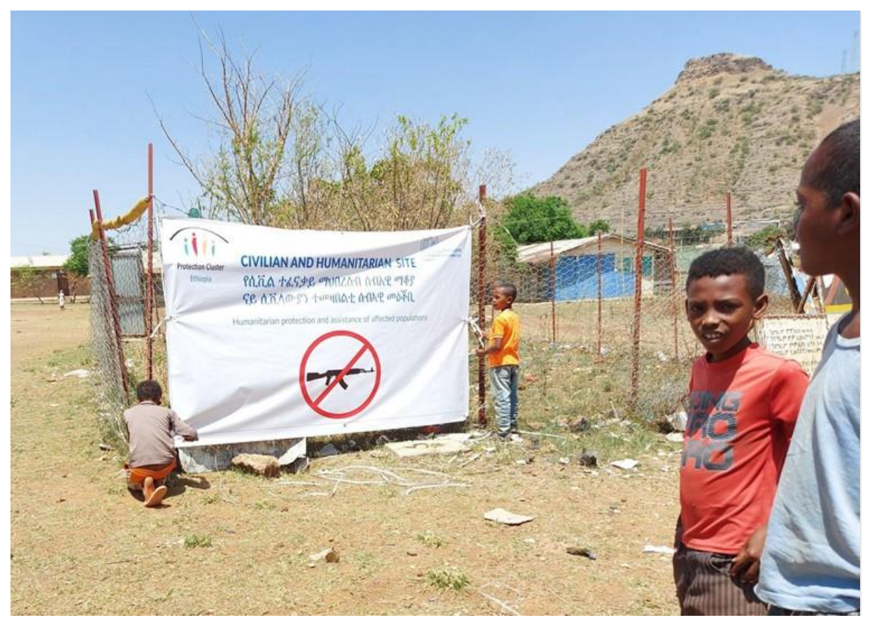
UNHCR has put up "No-Gun signs" in all IDP sites in Shire, and more are planned for other locations in Tigray region.