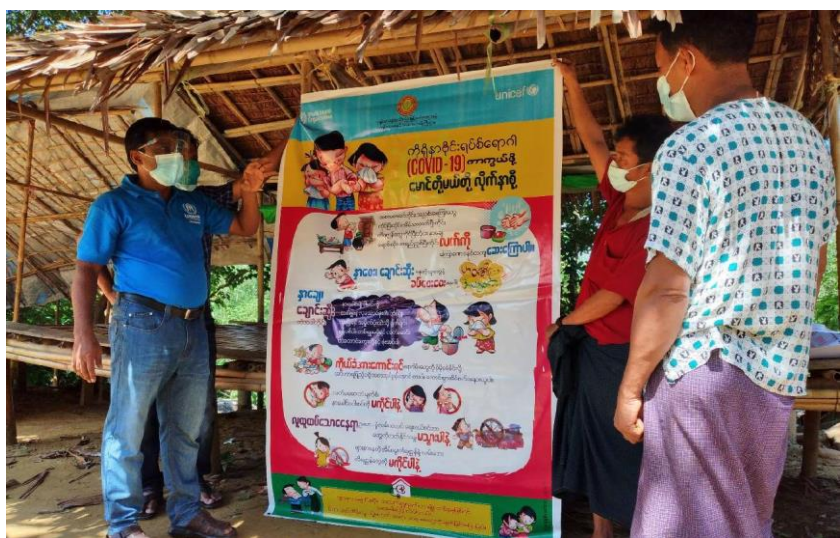
COVID-19 education and awareness raising being carried out at Mya Taung IDP site in Buthidaung Township, Northern Rakhine State, Myanmar. July 2021.