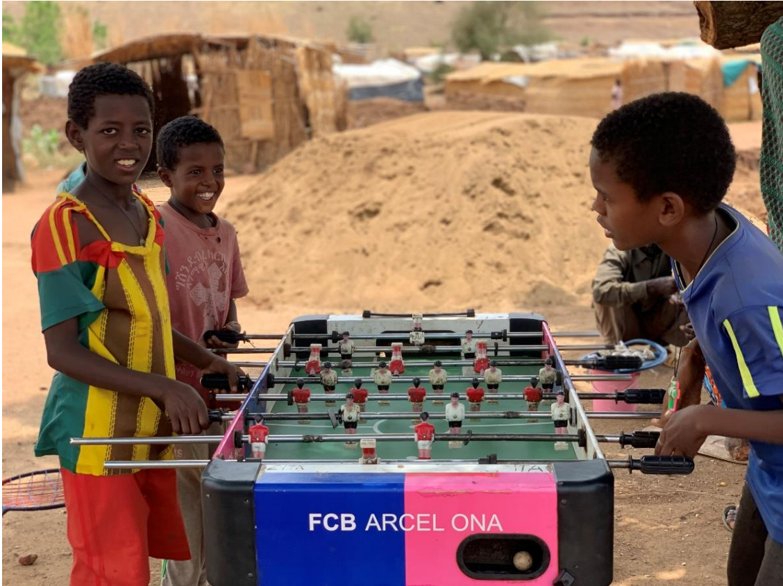
Refugee children play at Um Rakuba camp, Sudan.