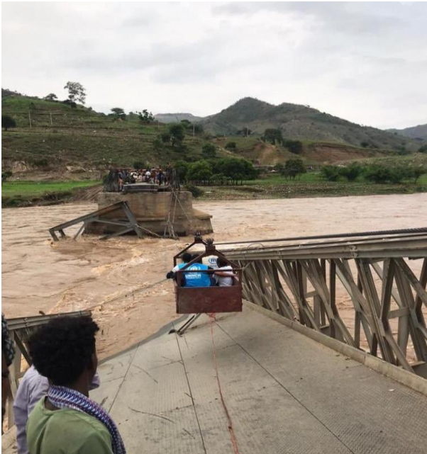
Pulleys and ladders used to cross the Tekeze river.

Adi Harush and Mai Aini: On 30 July, UNHCR and partners accessed Adi Harush and Mai Aini refugee camps for the first time since 13 July. The team ascertained that, while the situation inside the camps may be relatively calm, refugees are apprehensive and concerned about the insecure environment outside the camps. Refugees are presently unable to access local markets and basic services. Regional and zonal authorities have restricted the movements of refugees for security reasons. Food distribution in Mai Ani and Adi Harush camps that was due to take place at the end of July was postponed.