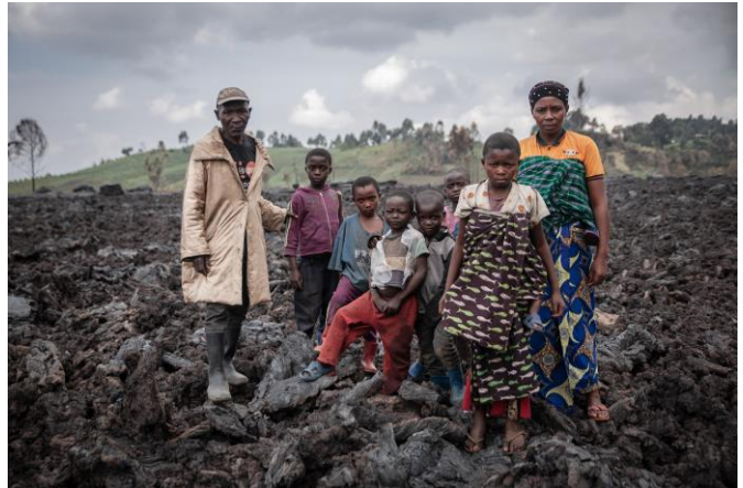
More than 350,000 people fled the eruption of Nyiragongo in May. Families like this one lost everything.

More than 67 per cent of forcibly displaced people in the region have fled conflict in the DRC , where intersecting crises have internally displaced nearly 5.2 million people and caused 1 million people to seek asylum. Conflict in Mozambique's Cabo Delgado Province has displaced more than 732,000 people as of June 2021 (according to IOM/DTM). Violence in the Central African Republic following the December 2020 elections resulted in a reported 73,600 people fleeing to the DRC and over 5,800 to RoC. In other parts of the region, refugee camps and settlements in Botswana, Malawi, Mozambique, Namibia, Zambia, and Zimbabwe host long-term populations , some of whom have spent decades in displacement.