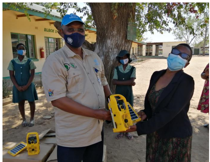
Solar radios support remote learning in Tongogara camp primary school.