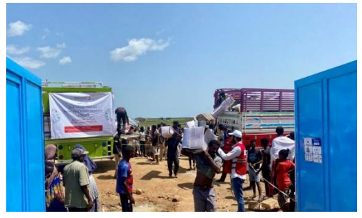
A total of 2,000 NFI kits were distributed to refugees