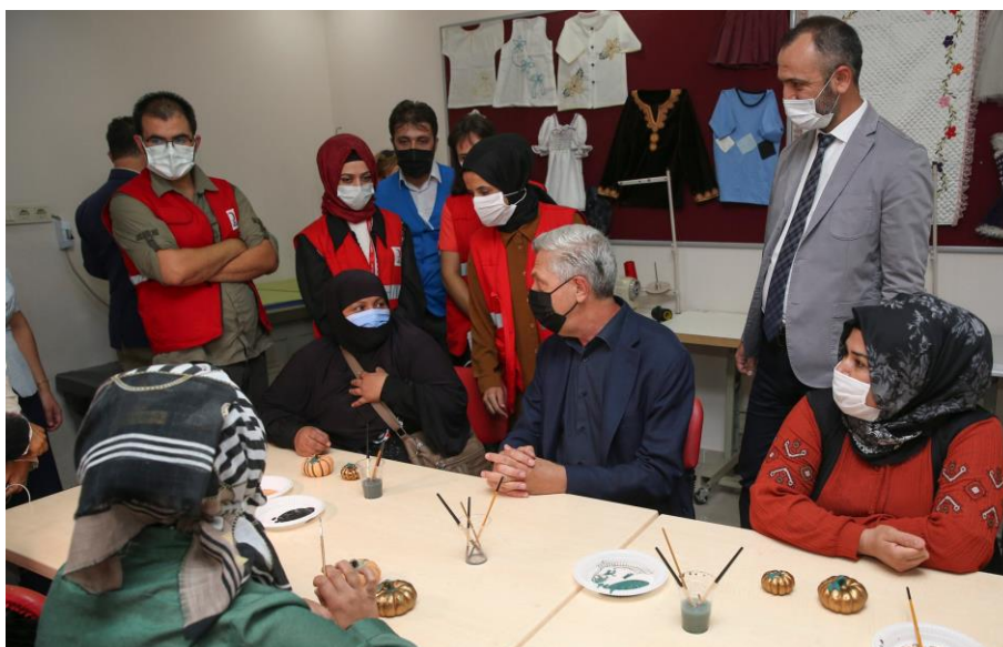
UNHCR High Commissioner, Filippo Grandi, visited Turkey from 7-11 September. Read more about the visit of the High Commissioner here .