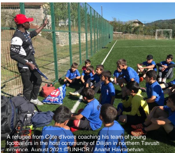
A refugee from Côte d'Ivoire coaching his team of young footballers in the host community of Dillijan in northern Tavush province. August 2021