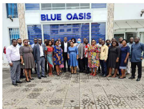
Stakeholder meeting with MMDAs.