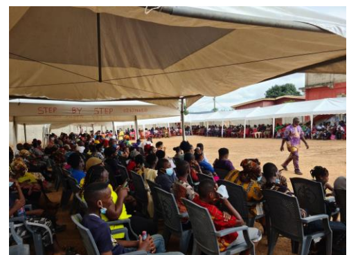
Urban outreach program at Kasoa.