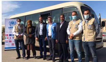
The handover ceremony in Awal, attended by UNHCR Chief of Mission and representatives of the cities of Awal and Dirj.

UNHCR continues to support internally displaced persons (IDPs), returnees, asylum-seekers, refugees, and host communities through quick impact projects (QIPs) in Libya. On 18 November, UNHCR handed over a school bus to representatives of the cities of Awal and Dirj, located in the west of Libya. The school bus, with a capacity of 28 seats, will operate from the city of Awal, 50 km west of Dirj, and will provide daily transportation for schoolboys and girls who were intermittently attending school due to lack of transportation. On 14 and 16 November, UNHCR also handed over Abdullah Albaloug school in Suq Aljumaa, and Al Qurdabia school in Sebha, both rehabilitated through partner ACTED. Each school has hundreds of students, including internally displaced and other children of concern to UNHCR. On 18 November, UNHCR also handed over two primary health care centres in Suq Aljumaa, rehabilitated by partner INTERSOS.