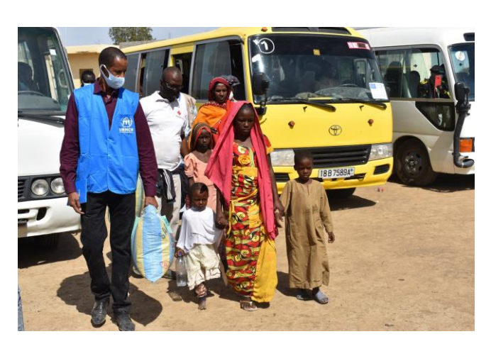
Chad – Relocation of refugees from Far North Cameroon into the Guilmey site on 5 January. They will be individually registered in the transit centre, before being allocated a family parcel and shelter.