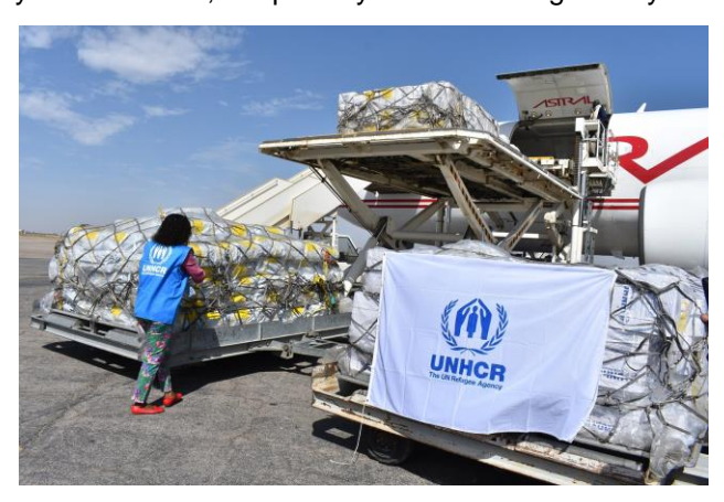
(Protection, WASH, Health and nutrition, Food Core relief items being loaded onto a plane to be airlifted Security) meet at least twice a week, along with ad to Chad. 5 January 2022.