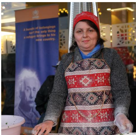
A woman displaced by the Nagorno-Karabakh conflict baking a traditional pie at the New Year Charity Bazaar organized by the UN Armenia and Aurora Humanitarian Initiative December 2021.

of hygiene items were distributed to the persons in a refugee-like situation as a result of the Nagorno-Karabakh conflict through Armenian Red Cross Society