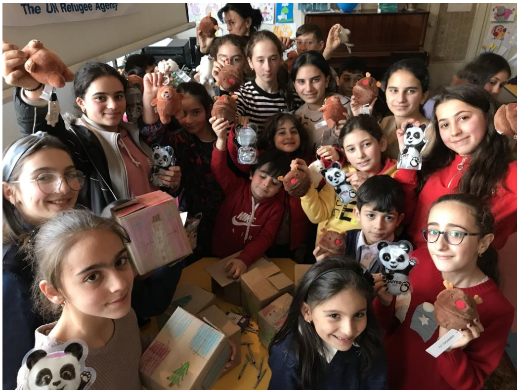
Christmas celebration with children displaced by the NK conflict at a child-friendly space in Goris, Syunik Province. December 2021.

UNHCR and partners are working toward enhancing the protection environment while providing assistance to those most at risk. UNHCR continues advocating for inclusion of persons of concern in national response plans, including COVID-19 recovery and vaccination plans and other legislative and administrative reforms.