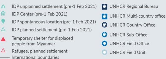
Estimated internal displacement within Myanmar Pre+Post 1 February 2021 (rounded to the nearest hundred)

The boundaries and names shown and the designations used on this map do not imply official endorsement or acceptance by the United Nations