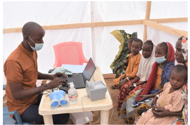
Chad – Individual basic registration of refugees in Guilmeiy site on 11 January 2022.

According to pre-registration of refugees in Chad and the needs assessment mission in Cameroon.