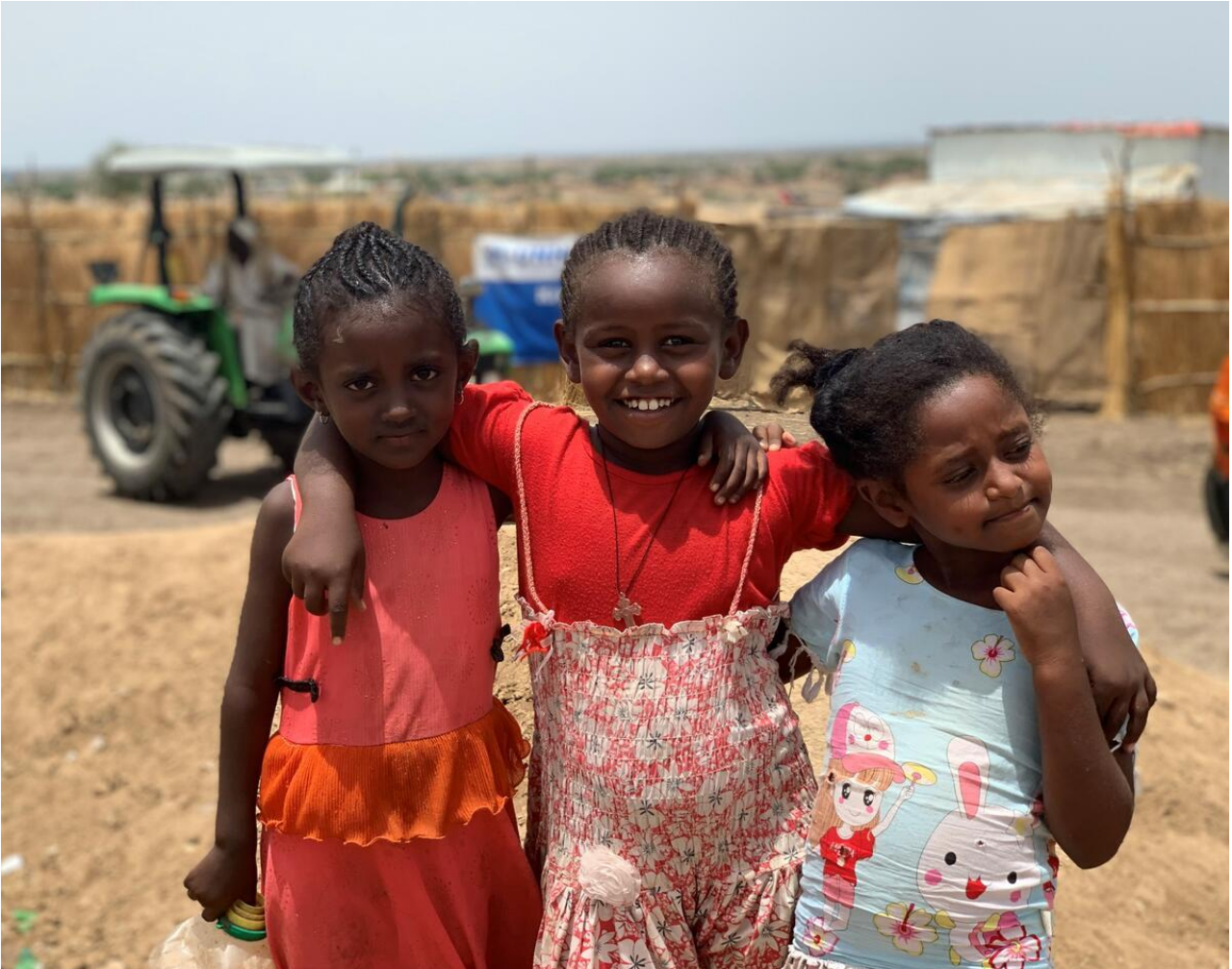
Refugee children at Hamdayet, near the Ethiopia-Sudan border where refugees from Tigray region are received.