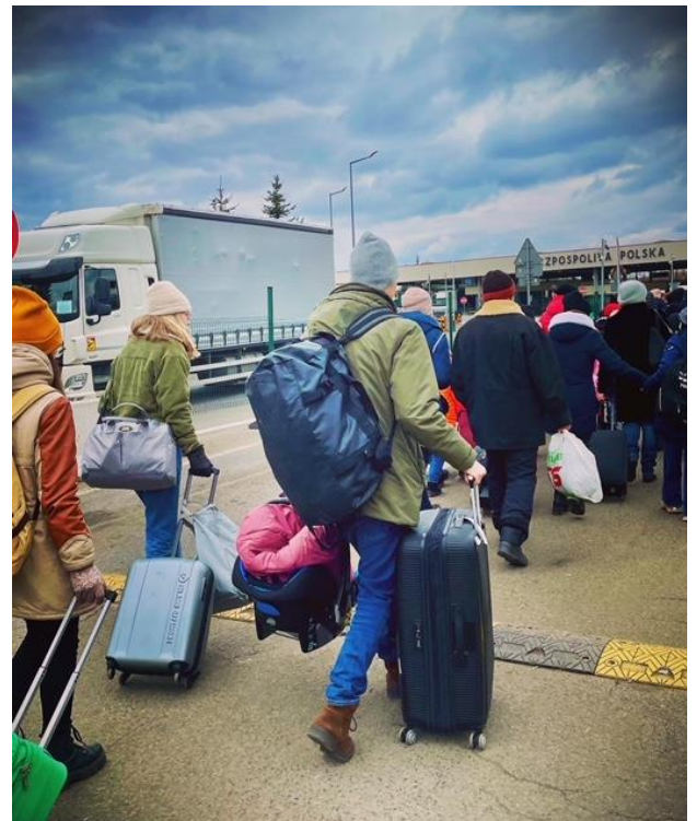
Newly arriving refugees approach the Polish border. 6 March 2022.

Please see the Operational Data Portal for the Ukraine Refugee Situation for additional details. Sign up for the UNHCR mailing list to receive regular updates on the Ukraine Situation.