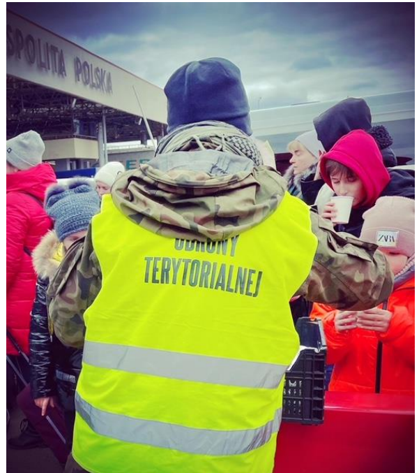
Newly arriving refugees at the Polish border crossing are offered hot tea while they await processing. 6 March 2022.