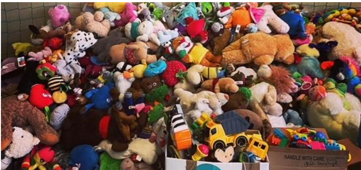
Piles of donated children's toys await distribution by volunteers at Medyka Reception Center along the border with Ukraine. 6 March 2022.