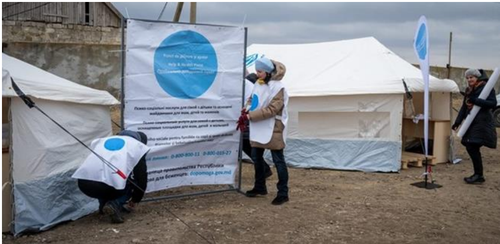
The Blue Dot at Palanca border crossing provide safe spaces for refugees to seek guidance, help and support.