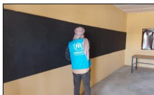
One of the new classrooms handed over to the authorities by UNHCR.

In the Gao region, where children face increasing barriers to attending school due to growing insecurity and a lack of adequate facilities , UNHCR, with the help of Japan's emergency fund , has helped build classrooms in several schools in the safest areas hosting a growing number of forcibly displaced children.