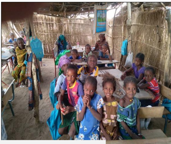
Refugee children in their classroom.

Since 2017, a small refugee village in eastern Senegal, about 700 kilometers from Dakar and on the border with Mauritania, has opened a primary school.