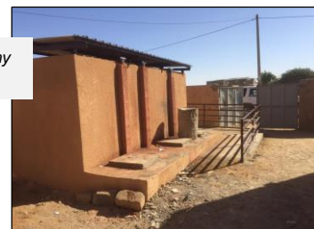
Latrine blocks for students accompany the new classrooms. @UNHCR Mali

In the Gao region, where children face increasing barriers to attending school due to growing insecurity and a lack of adequate facilities , UNHCR, with the help of Japan's emergency fund , has helped build classrooms in several schools in the safest areas hosting a growing number of forcibly displaced children.