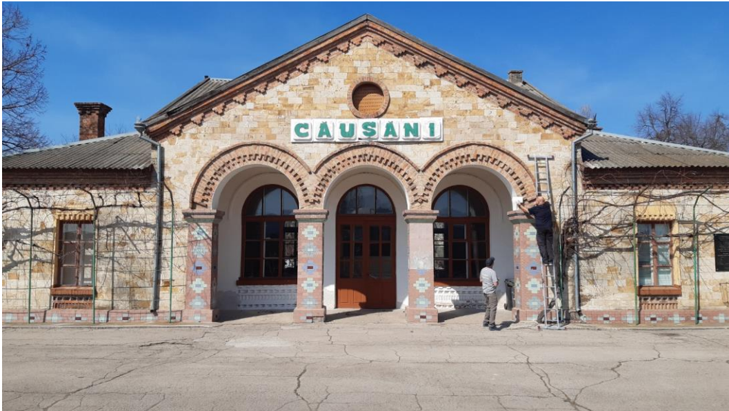
ACTED and Ericsson Response complete the installation of Wi-Fi for humanitarian actors and refugees in Căușeni train stations, one of the main transit points for Ukrainian refugees